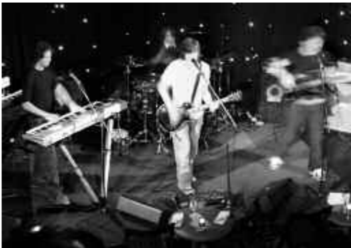
Above: This year's runners up Jub, from Bath Spa University

The awards, initiated by the MBF and held annually, are aimed at encouraging young songwriters and new talent. The top prize certainly opened doors for last year's winners, The Wombats, who were special guest performers on the night. Their second single "Moving to New York" was released earlier in the week.